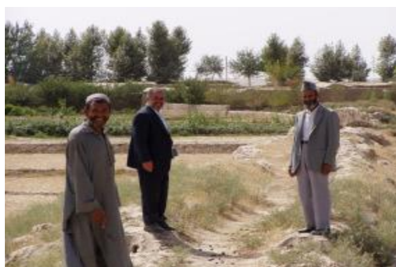
Fig. 7. Network of ground canals in the Pyandzh floodplain near Qarakutermah

These canals form a network from which water flows by its own accord (flooding control) into more distant plots. The water pumping station currently is completely destroyed, and the main canal is in ruins. However, the distributive network has been kept almost intact. This system used to provide sprinkling and potable water for more than 450 local families with their children, who now have to look for a way of