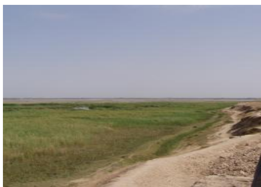
Fig. 6. Farming irrigated lands on the dry river bank of Pyandzh

It was further distributed through the left and dextral networks of shallow ground canals that can still be differentiated (Fig.6, 7).