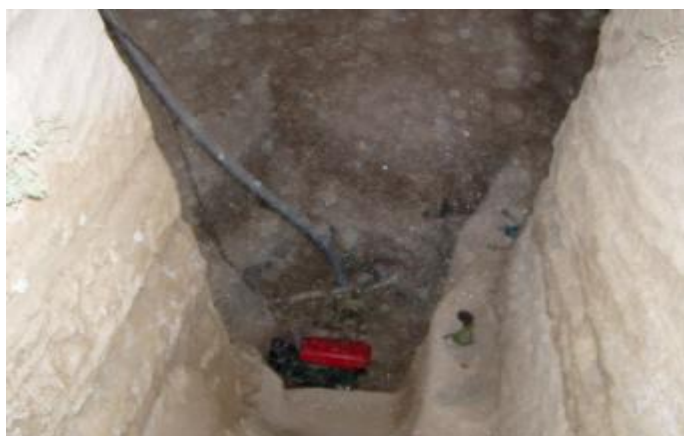
Fig. 14, & 15. A scheme of the built of subsoil water reservoirs (only a few families manage it for their private use)

equivalent of 'Kariz' in China, 'Kanat' in Iran and the Middle East, or 'Foggara' in North Africa (Fig. 14, 15).