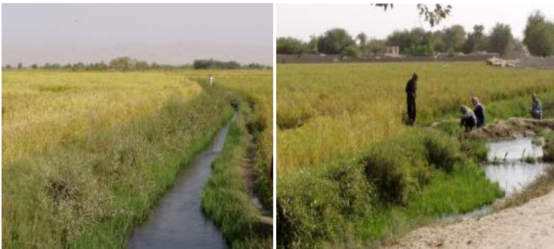
Fig. 38,39. Collector-drainage canals (the participants of expedition doing water analysis in the field).

The experiments on introduction of foreign sorts of rice have not shown positive results yet. A drainage network consisting of small channels between rice cropping fields has been manually constructed. An analysis of the physical parameters of water from this source did not show salinity (Fig. 38, 39).