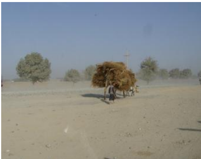
Fig. 23. Fuel wood and herbs collection by local people on Shirmohi desert

During an interview with the local people it was learned that the worst nightmare of Afghans working on their fields or taking their livestock to pastures is the risk of landmines. The presence of a large number of landmines makes Afghanistan the world's most deadly minefield. According to a survey on 37 communities of Afghan people in 1994 that was conducted by CIET International, landmines had affected the lives of 12% of all households (Anderson et al., 1995).