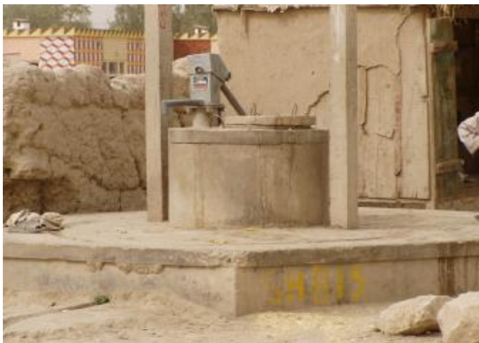
Fig. 12, & 13. Different types of wells widely popular in Kunduz province, used for drinking purpose

construct a mechanical design of wells. Most of them work under financial support of different International Agencies, such as US agency for International Development (USAID) and the Canadian-based International Development Research Center.