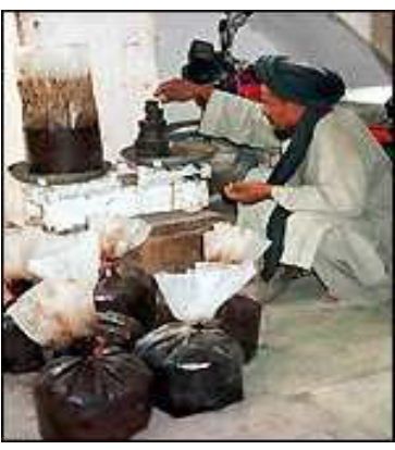
Figure 4. Many of the factories that are used to process opium into different types of Heroin, may be nothing more than a shack.