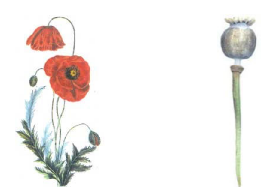
Figure 2. The "poppy" plant with its characteristic red flowers, and the notorious capsules.